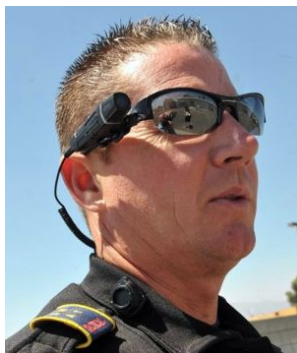
A police officer in California wears an AXON flex police camera.